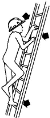
3 Point Contact